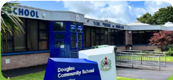
CEC Host Family Centre Douglas Community School

Douglas is a residential suburb of Cork City located about 2 km from the city centre.