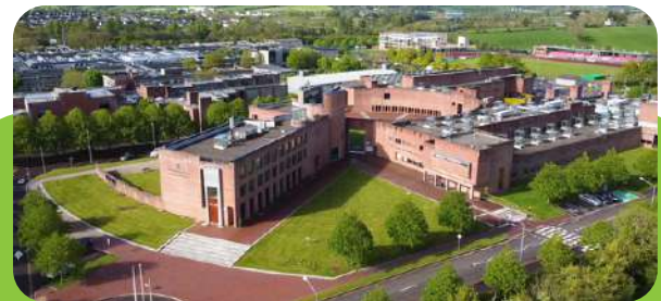
CEC Residential Centre Munster Technological University

A bus journey from the school to the city centre takes no more than 15 minutes.